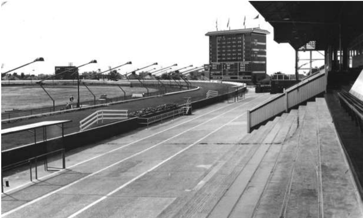
Brighton pictured in 1982.

In 1991 Coral announced that their tracks would be sold to fund the purchase of 73 bingo halls from Granada Theatre Ltd but despite the deal being struck and subsequent birth of Gala Bingo the tracks remained under the ownership of Coral. However Coral did lose a court case around the same time to the Alliance and Leicester forcing them to relinquish land where the Orchard Road enclosure stood.