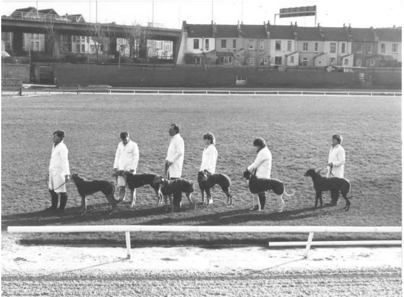
Greyhounds parading during a BAGS meeting.

On 27 th October 1997 a second body blow came to the sport after the Hackney debacle when the BS Group sold Eastville for development, plans were announced for a new Bristol greyhound stadium but never came to fruition. The BS Group management switched the entire operation, including trainers, racing office staff and bookmakers forty miles up the M4 to newly acquired Swindon, even the BAGS contract was taken on by Swindon.