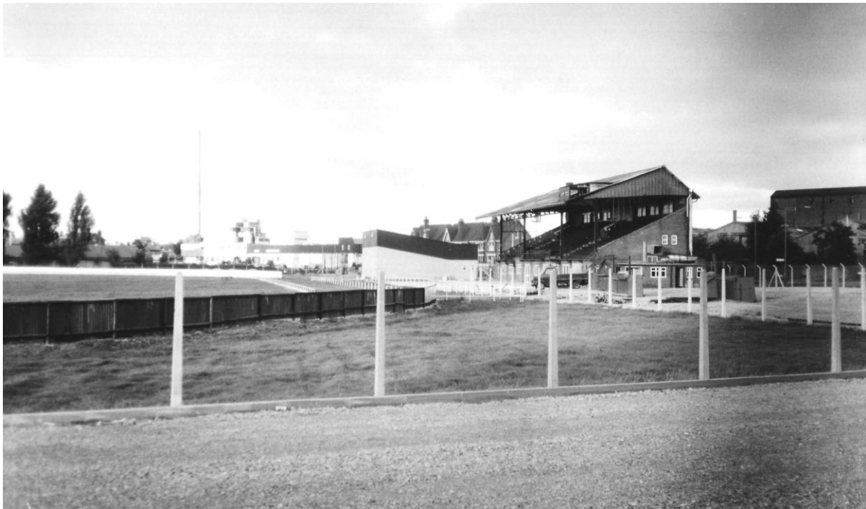
Perry Barr

Even a disastrous fire in April 1937 failed to halt progress at this Midlands track, the fire caused £12,000 worth of damage, a very significant figure in 1937. The Birmingham Cup was introduced in 1939 as the premier event to be held annually and it was quickly established as a notable competition.